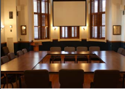
SQUARE Accommodates 10-20