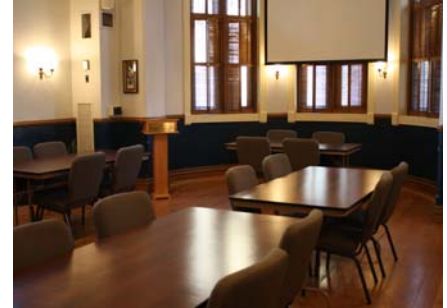
SMALL GROUPS Accommodates 30