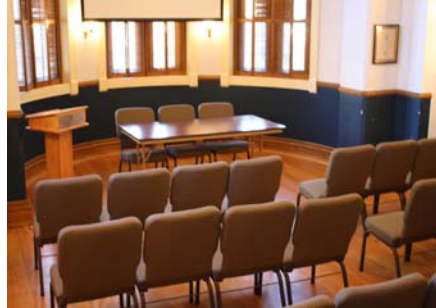
LECTURE Accommodates 30